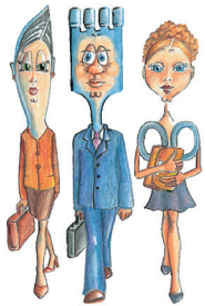
The Instrument Guys

Come to Tuttlingen and share two / three days filled with